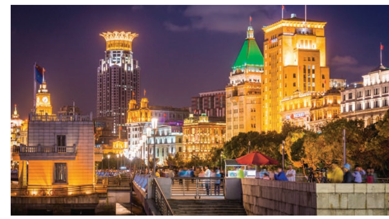
Puxi region of Shanghai

Pudong is more peaceful and green, with the expatriate havens of Jin Qiao and Kang Qiao. On the Puxi side, the most popular districts are Changning, Xuhui, Jing An and Lu Wan.